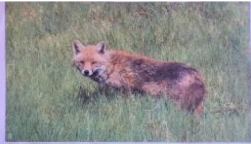
Cut these tree down